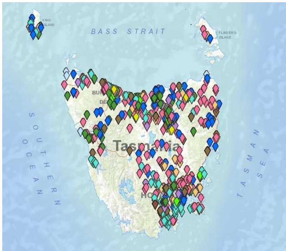
Image showing all level 2 activities under active regulation

ASSESSMENT: The EPA assesses proposed activities that are classified as Level 2 activities under EMPCA